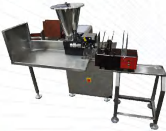
Incense Stick Making Machine