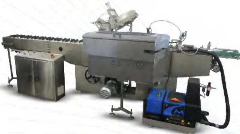
Automatic Cartoning Machine