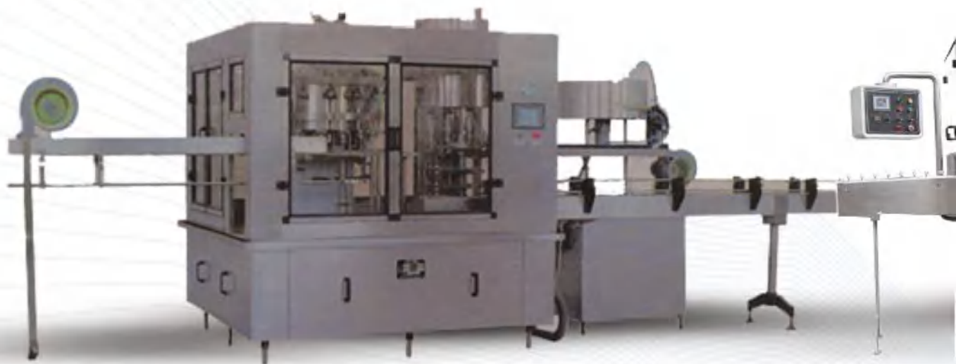
Rotary Oil Filling & Capping Machine