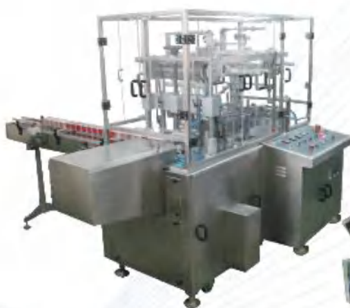
Over wrapping Machine