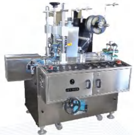
Automatic Over wrapping Machine