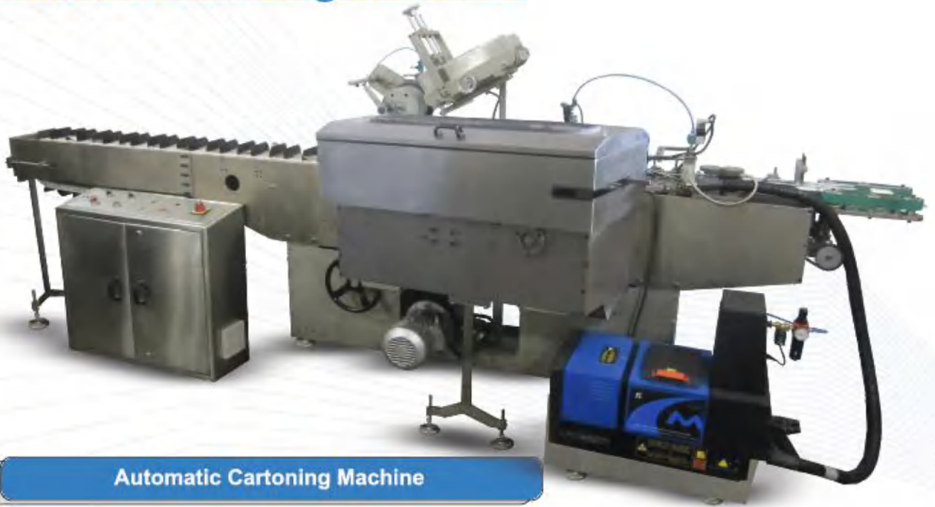
Automatic Cartoning Machine