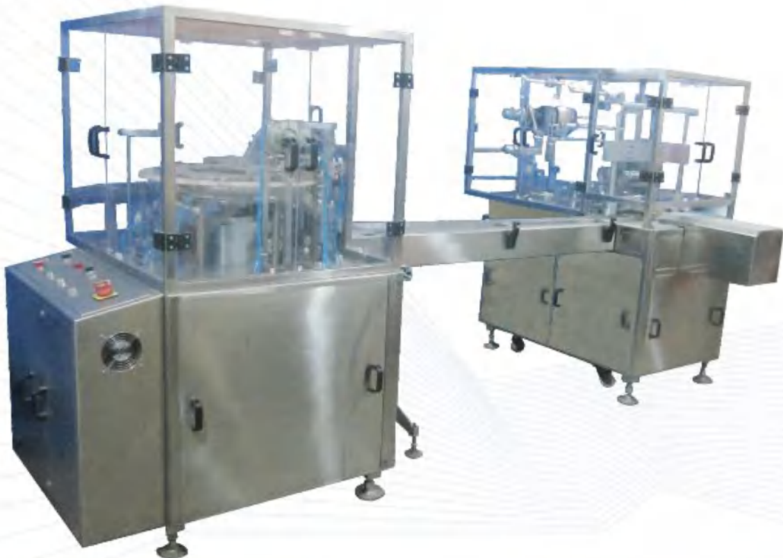
Vertical Cartoning Machine