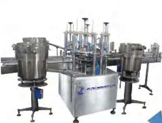
Actuator & Tear-off Seal Placement