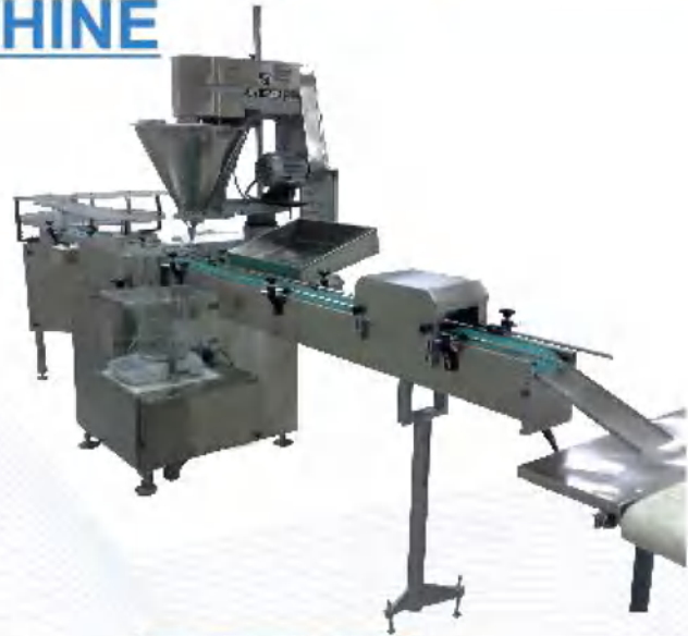
JET PF45 PH