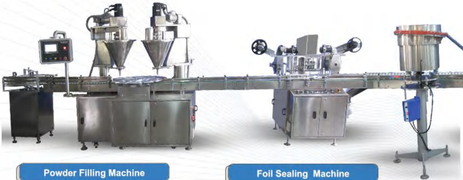
Powder Filling Machine