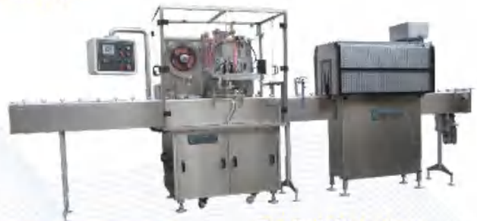
Body / Sleeving