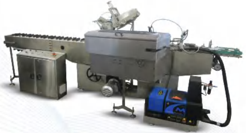
Automatic Cartoning Machine