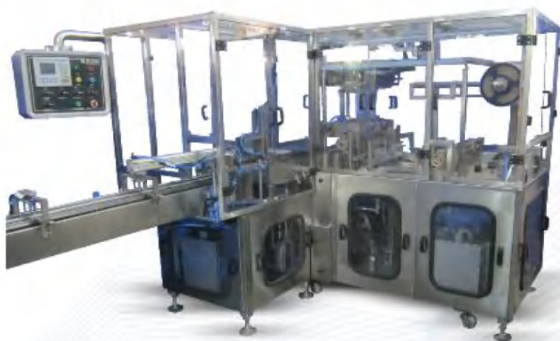
Collating & Overwrapping Machine