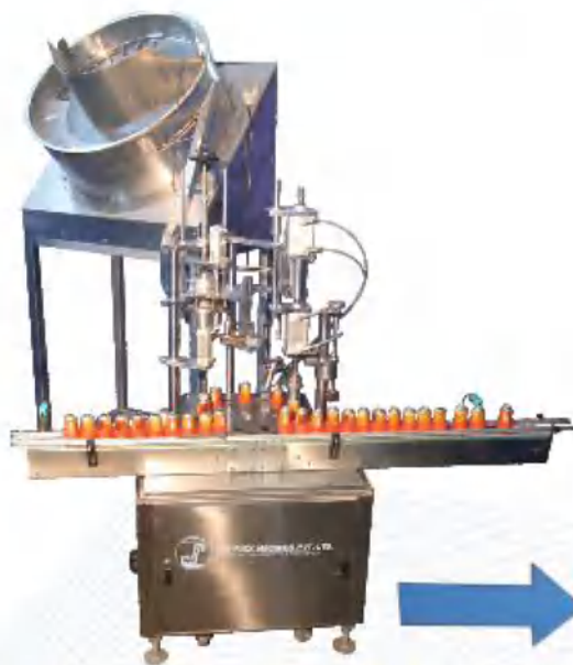
Pump Placement And Crimping